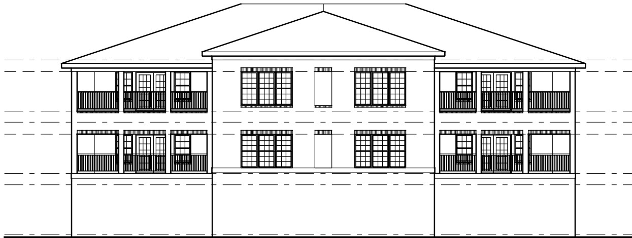
REAR ELEVATION SCALE: 1/8" = 1'-0"