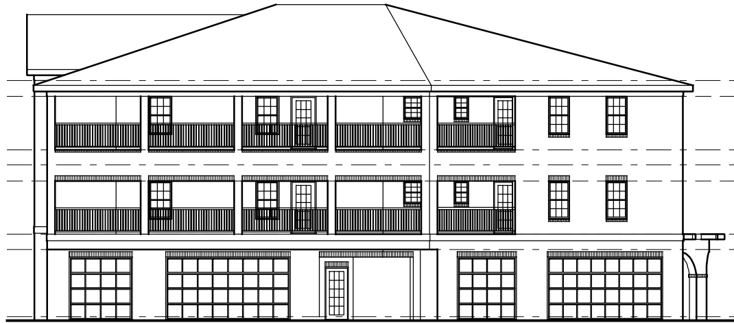
Ⓐ LEFT ELEVATION SCALE: 3/8" = 1'-0"